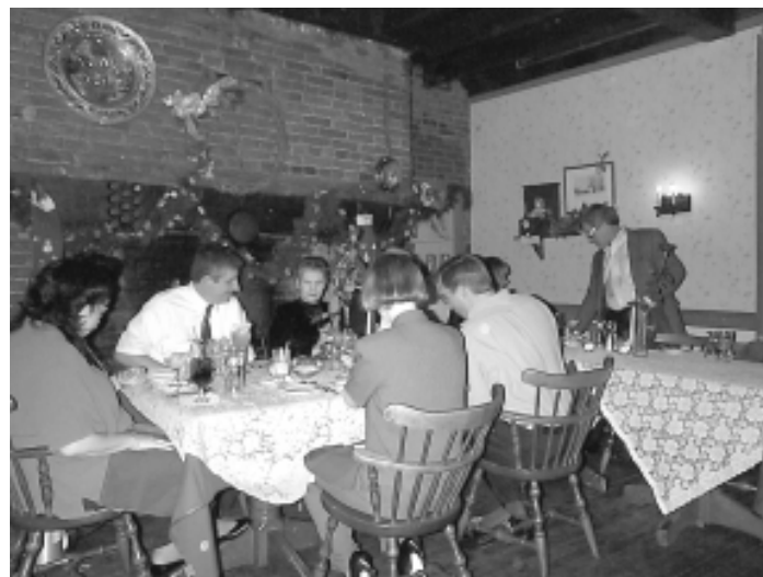
So was the dinner conversation.