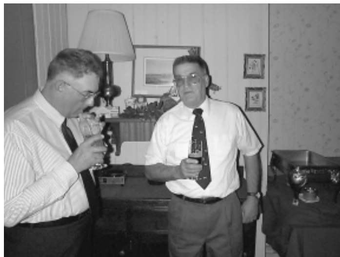
The beer was good!