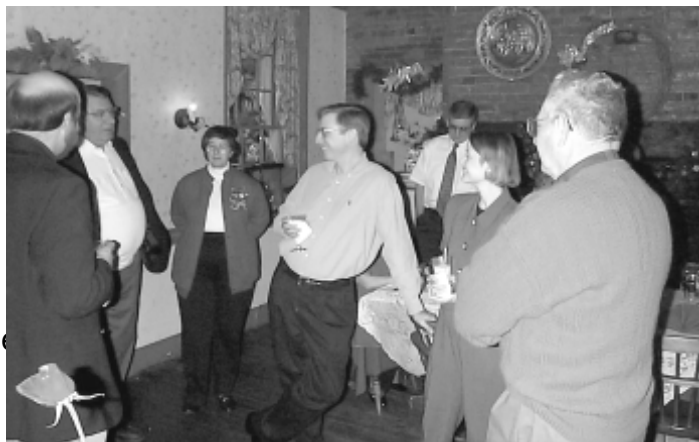
The welcoming committee...