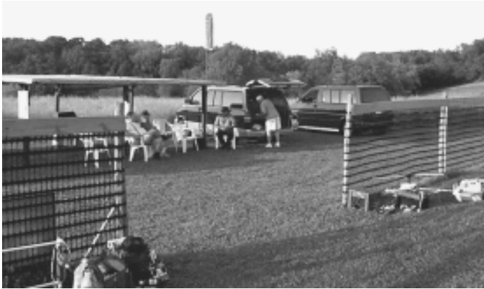
West Field on a good day.

Cream Road has been closed at the bridge east of the field. West Field can only be accessed from the West. Take Jackson School road West to Scroggy Road North to Cream Road.