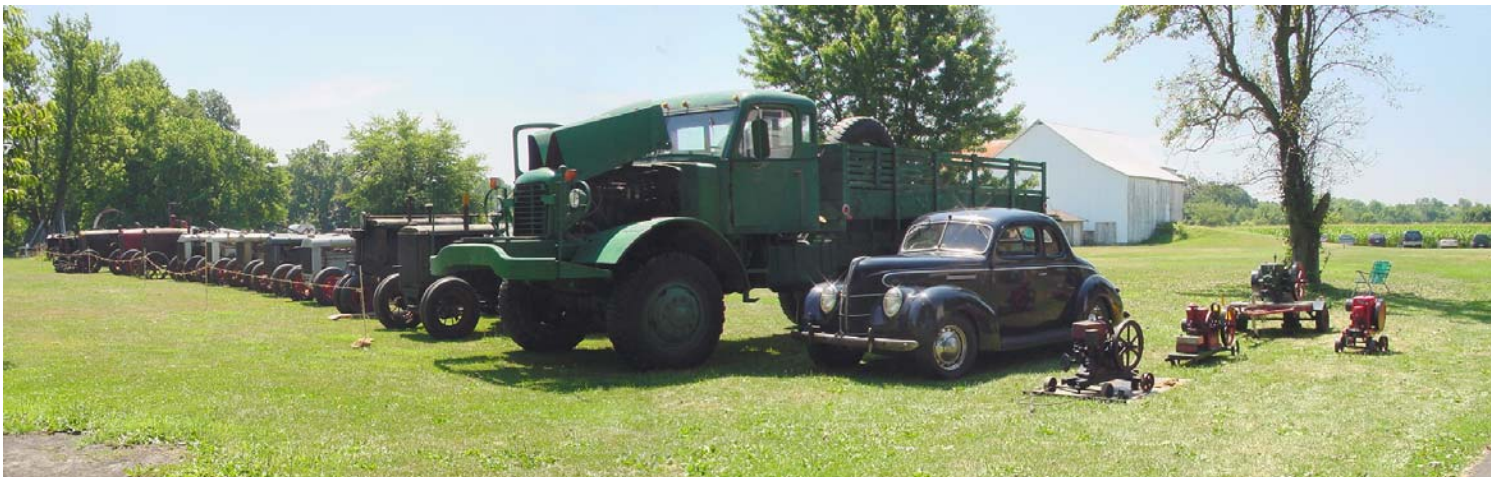
"Walt's Amazing Collection of Antique Machines"