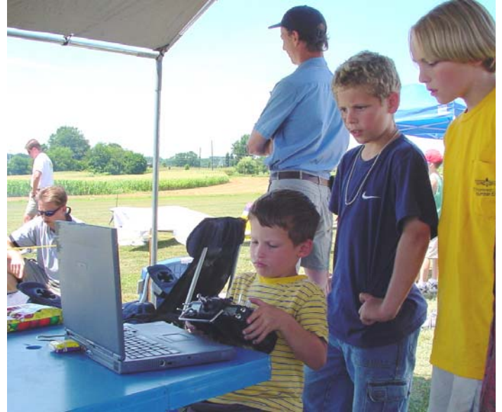
Youngsters try out the simulator. All the fun without the risk!