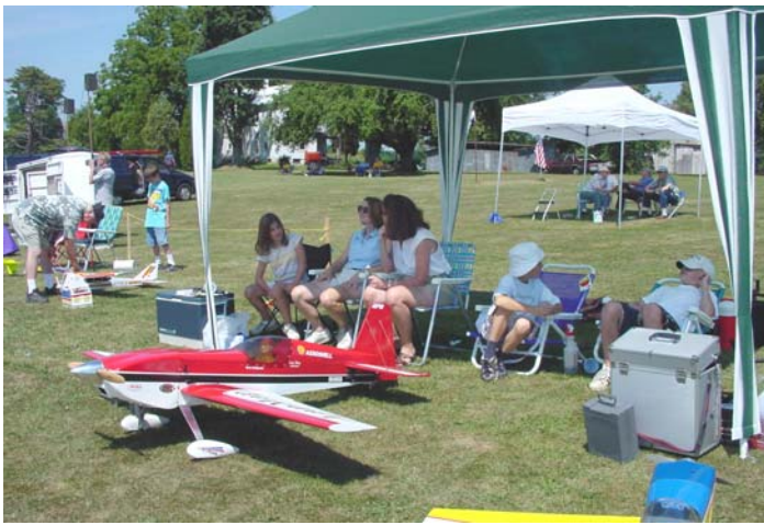
Spectators tried to stay cool in the shade.