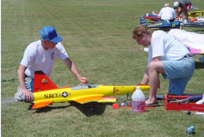
You have to start these things topless!