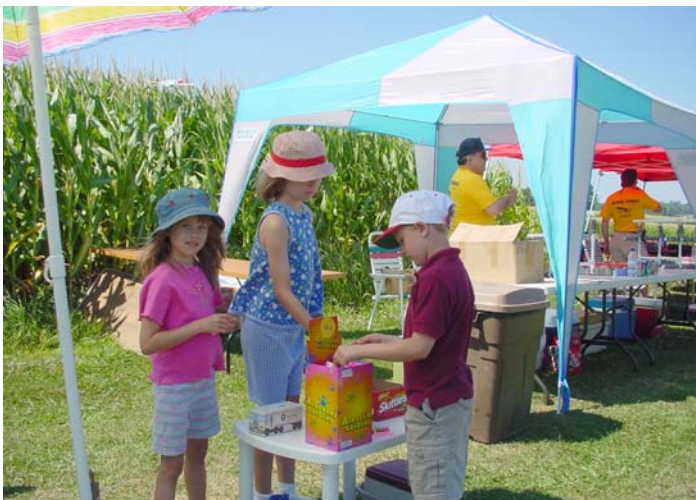
Candy sales were brisk.