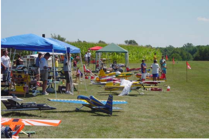
The flight line was crowded.