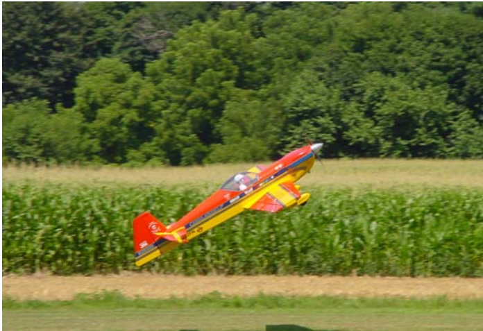
Hey, airplanes aren't supposed to hover!