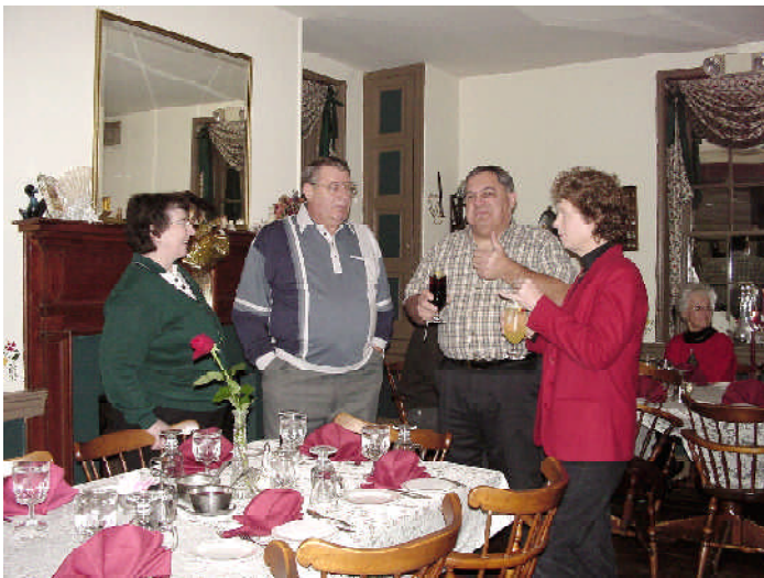
The gathering starts with drinks and socializing