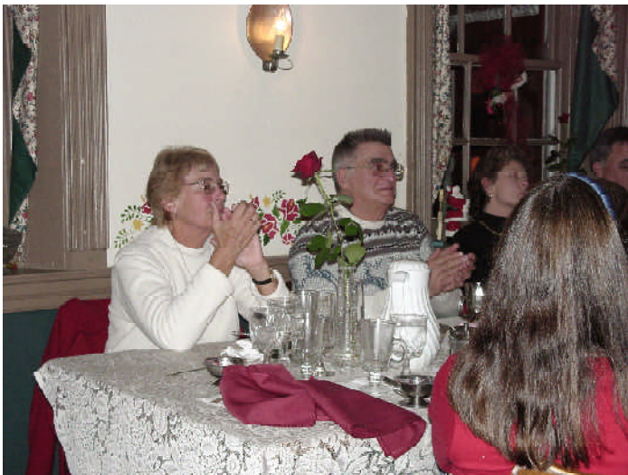
... but everyone applauds when the speech is over!