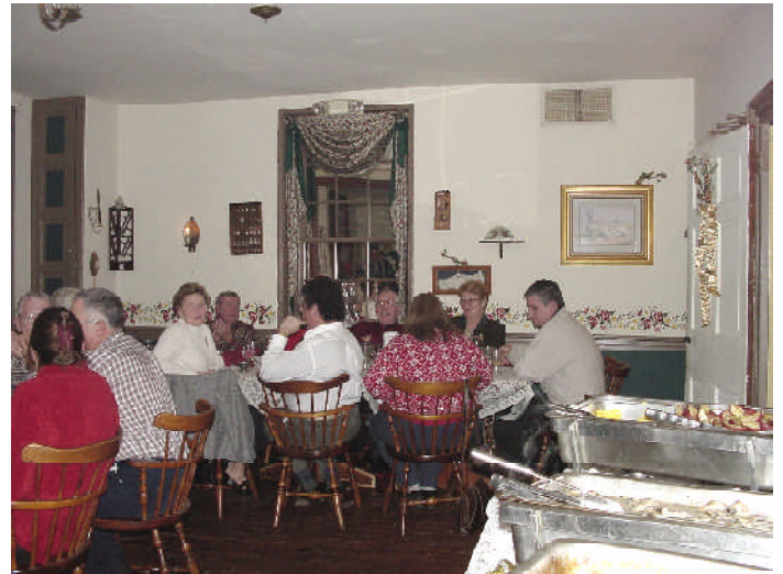
There was quite a crowd ...

Enjoy the pictures; and if you didn't attend, maybe this will convince you to attend next year.