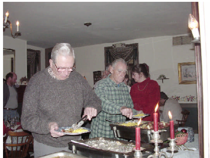
... and plenty of food