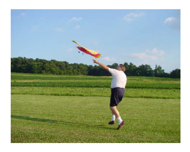
Dick shows how to get airborne!