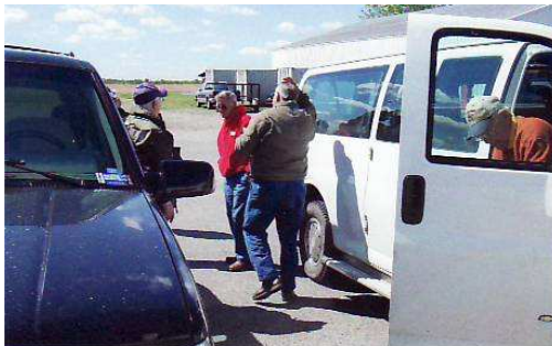
Arriving at Museum

The museum is only about an hour drive from Oxford and well worth the trip. Check out the attached photographs.