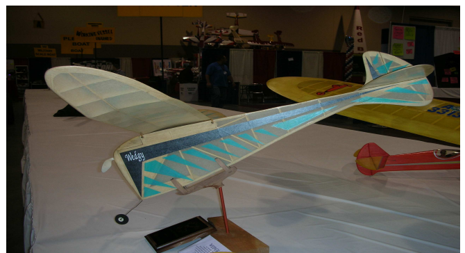
Remember; vintage is a frame of mind. See you at the field.