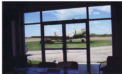
View out Library Window