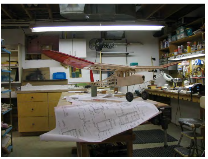
Tommy sent in pictures of his Little Stick, a scaled down version of the Ugly Stik.